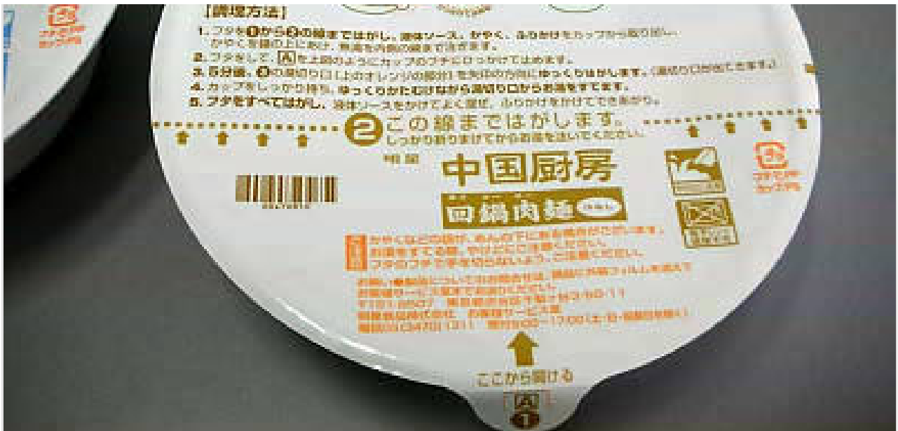
Contents is like this. Finely, liquid sauce, sprinkle.